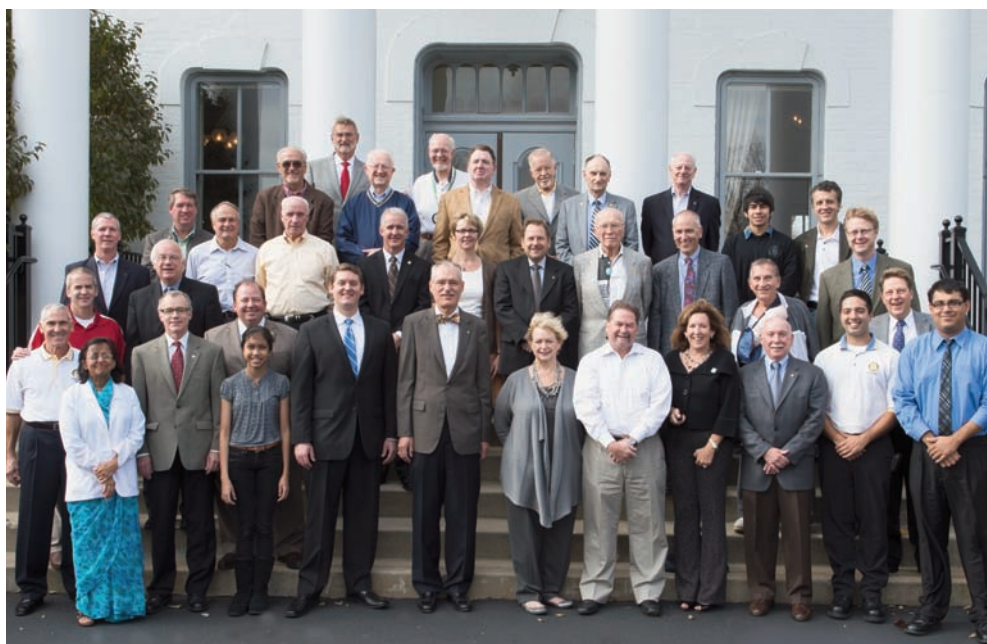
Group shot of 2013 Rotary Club of Elmhurst members.

It is with appreciation for the Rotary Club of Elmhurst’s strong philanthropic presence in our community and internationally that WSPN is pleased to present them with the Service Club Philanthropic Award. ●